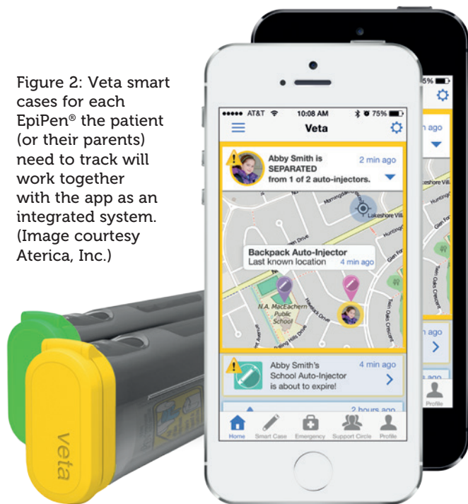
Figure 2: Veta smart cases for each EpiPen® the patient (or their parents) need to track will work together with the app as an integrated system.