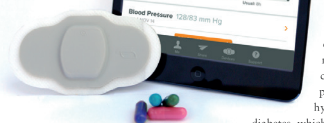
Figure 6: The Proteus platform comprises four elements: sensor-enabled pills, containing an ingestion sensor; body-worn patch (pictured) which receives a signal from the pill; the Discover App (pictured); and the Discover portal, for physicians.

6) comprises four elements: sensor-enabled pills, containing an ingestion sensor the size of a grain of sand; a body-worn patch which receives a signal from the pill when it reaches the stomach;