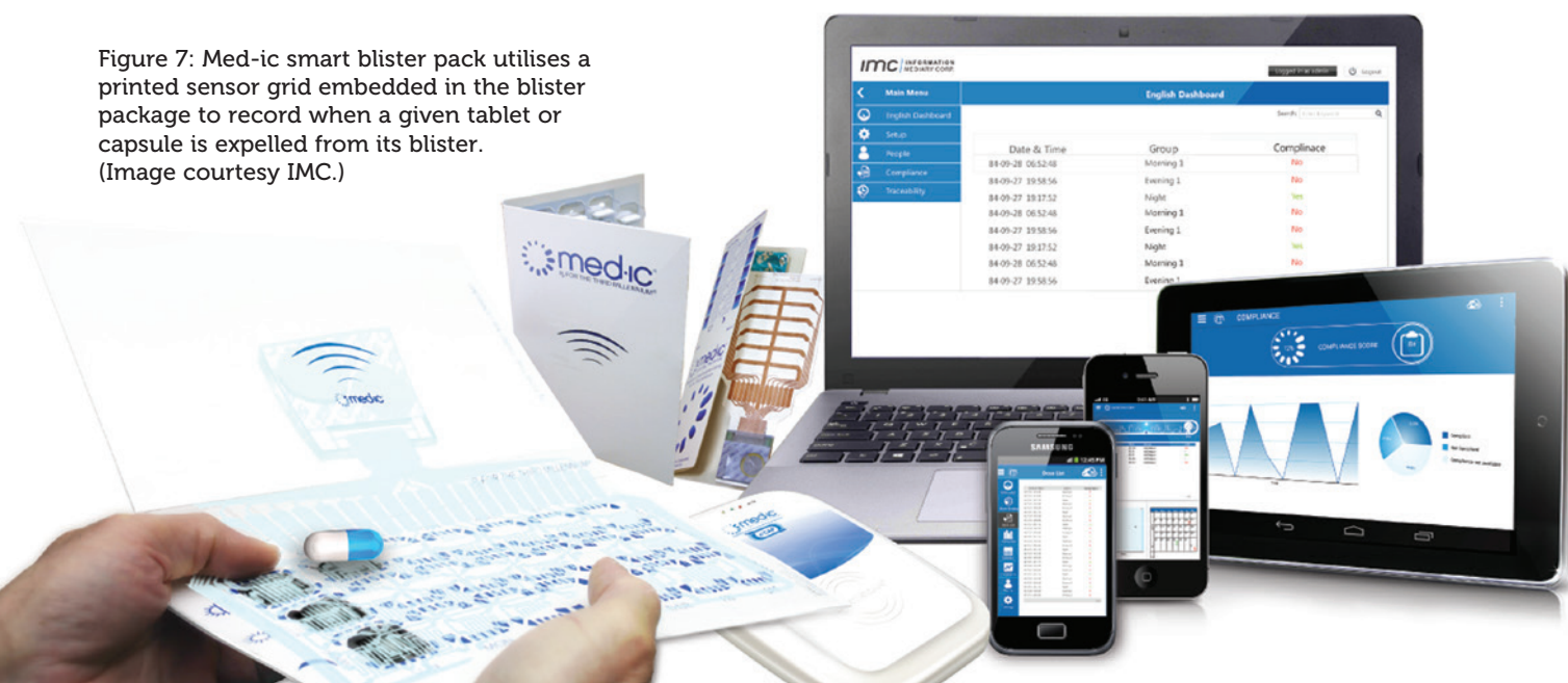
Figure 7: Med-ic smart blister pack utilises a printed sensor grid embedded in the blister package to record when a given tablet or capsule is expelled from its blister.

At the time of refilling the prescription or during a clinical trial follow-up visit, the patient's compliance data are downloaded to a PC via a CertiScan® RFID Reader, or downloaded using any NFC-enabled