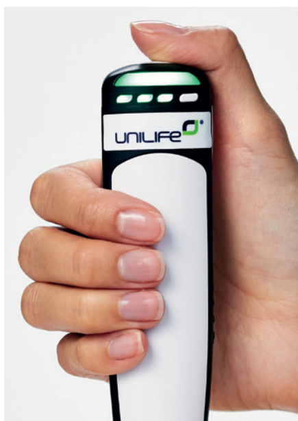
Figure 4: Unilife’s LISA™ platform of smart disposable auto injectors allows pairing of the device with Bluetooth LE connectivity as well as a related app.

Propeller Health (Madison, WI, US) is developing an add-on with associated app, which connects asthma and COPD