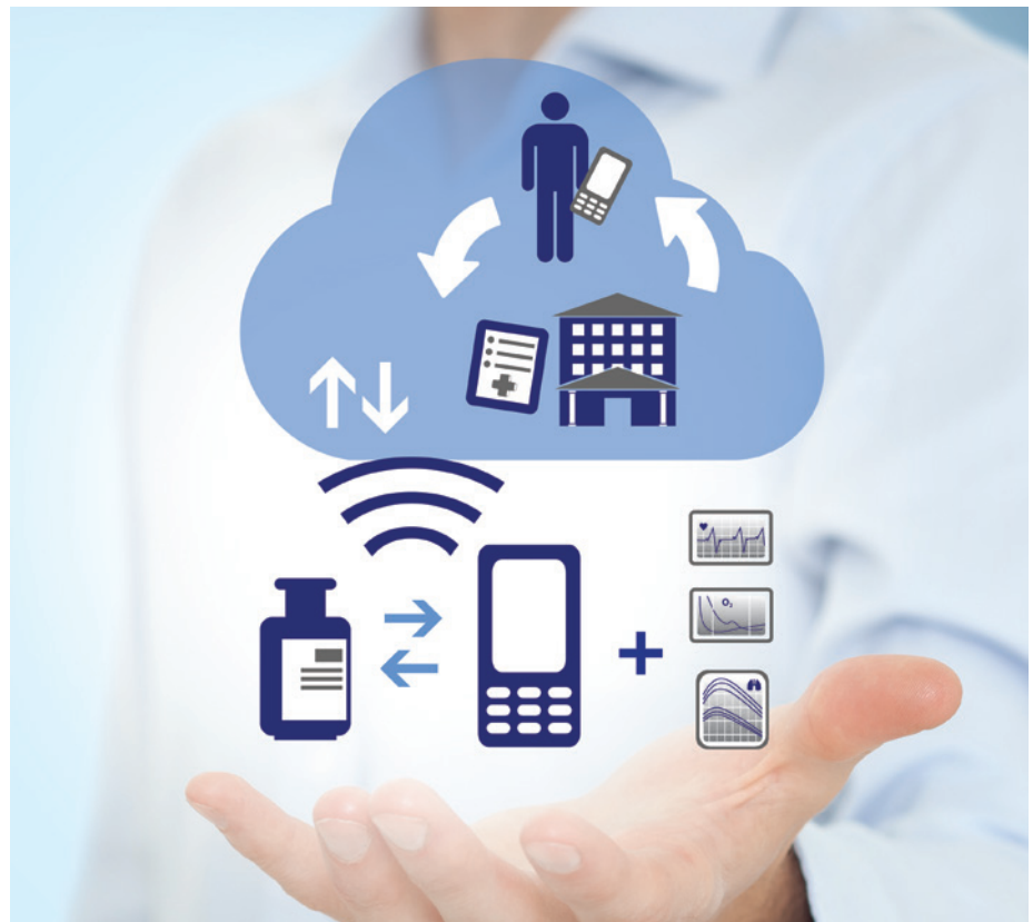
Figure 1: The elements of a typical connected drug delivery device system. (Design by Kelly Barkhurst/smartpr.)

With the arrival of mobile phones came mHealth, an abbreviation for mobile health, the practice of medicine and public health supported by mobile devices. The term is most commonly used with reference to mobile communication devices, such as mobile phones and tablets, for health services and information, but also to affect emotional states. The mHealth field has emerged as a sub-segment of eHealth, the use of information and communication technology