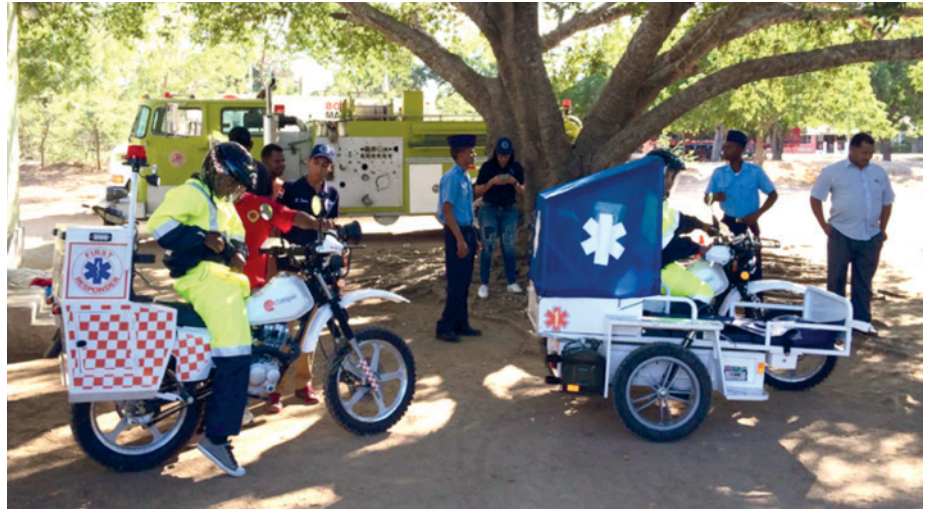
Figure 9: The difficulties involved with delivering emergency care to a remote location in the developing world

Developing countries will explore more creative uses of connected combination products. Just as with the smart phone and the internet, developing countries may enjoy greater benefits because they are not bound by legacy customs and systems. A number of US leading companies including Cardinal Health have already partnered with non-profit organisation Trek Medics International (New York, NY, US) which