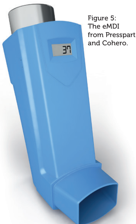
Figure 5: The eMDI from Presspart and Cohero.

disease outcomes. For example, earlier in 2016, results were published of a 12-month, randomised, controlled clinical trial conducted by Dignity Health (San Francisco, CA, US) investigating short-acting beta agonist (SABA) use in 495 asthmatics. The paper concluded that, compared with the control group which received routine care without the connectivity of the Propeller platform, “the study arm monitoring SABA use with the Propeller Health system significantly decreased SABA use, increased SABA-free days, and improved ACT scores (the latter among adults initially lacking asthma control). 5