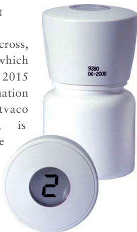
Figure 8: MEMSCap is a connected, child-resistant cap with integrated circuits that fits most standard pill vial sizes.

WestRock (Norcross, GA, US), which was formed in 2015 from a combination of MeadWestvaco and RockTenn, is developing a range of connected smart packaging for oral dosage forms. MEMSCap for example, is a connected, child-resistant cap with integrated circuits that fits most standard pill vial sizes and can record up to 3,800 dosing events (Figure 8).